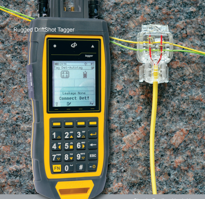
Simple Busline Hook-Up